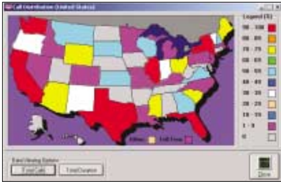
Monitor and analyze geographical call patterns.